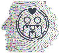
MSS Mental Health Resource

This is a mental health resource that will appear in the E-Bulletin weekly that was created by past and present Markville students.